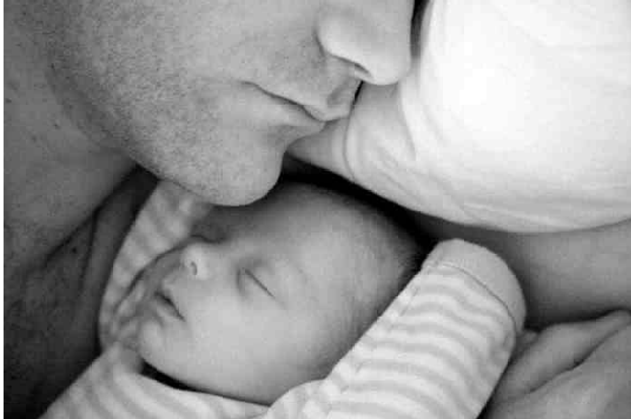
Photo: father and child